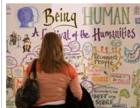
Above: Being Human Festival

As pioneers in education, we will ensure the growth and inclusiveness of our uniquely flexible education. We will expand our scholarship programmes and collaborative partnerships within the University and beyond for the benefit of our students, scholars, their communities and society.