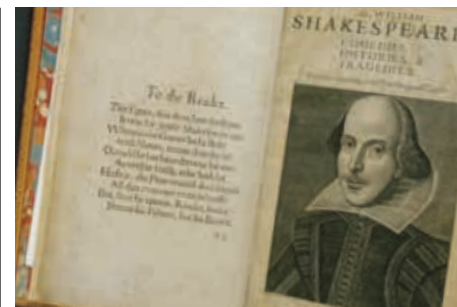
Above: A copy of Shakespeare's first folio from Senate House Library

We contribute to our local community through public engagement projects and access to our facilities. Many of our research seminars and events are open to the public and available online, helping us to promote learning and scholarship more widely.