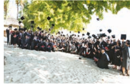
Above: University of London International Programmes graduation ceremony in Mauritius.

Innovation characterises the University of London. We were the first University in the UK to open degree programmes to women, to encourage students of all beliefs and faiths, and to welcome ordinary working people to participate in a previously closed education system.