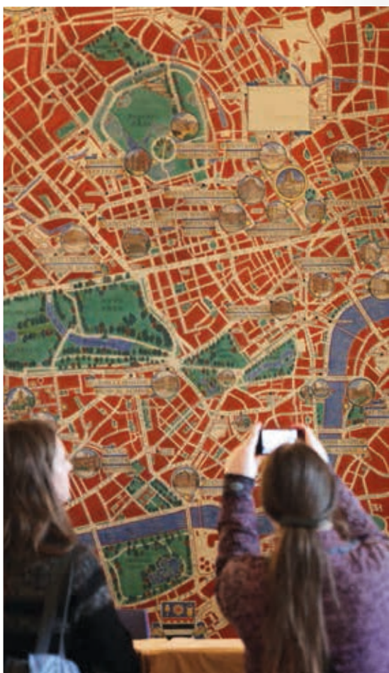
Right: Map of the University of London by Macdonald Gill in Chancellor's Hall.

London is a global hub for academic excellence. Recognised worldwide as being at the intellectual heart of the city, the University of London and the independent member institutions play a key role in the promotion of learning and knowledge thanks to our national and international reach. Our research and teaching is globally renowned, and across the world, the University of London plays a significant role as an ambassador for the UK's academic endeavours.